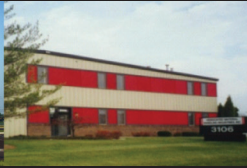
FORT WAYNE, IN