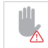
Controlled Stop Functionality

An operator can then continue operation of the truck, but speed is limited to 1 mph until the object has been removed.