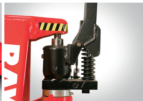
Heavy duty pump.