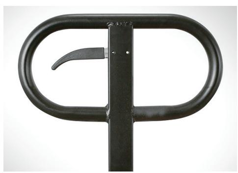
Three position fingertip control lever.

The Raymond Heavy Duty has full 180-degree turning radius providing exceptional maneuverability in tight areas. Standard variable speed lowering reduces the chance of product damage. Entry and exit rollers provide smooth transitions in and out of pallets, and improved load handling.