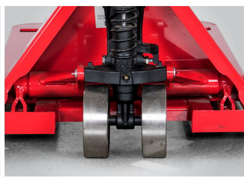
Solid steel wheels and rollers.