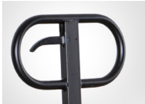
Three position fingertip control lever