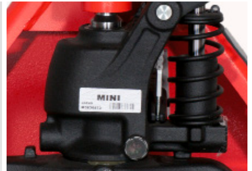
One-piece cast hydraulic pump