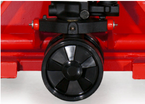
The unit is equipped with rugged black nylon wheels and steel load rollers

By design, the Low- and Ultra-low can access pallets of skids with low clearance openings.